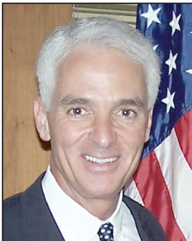
Charlie Crist (NPA)