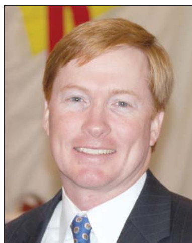
Adam Putnam (R)