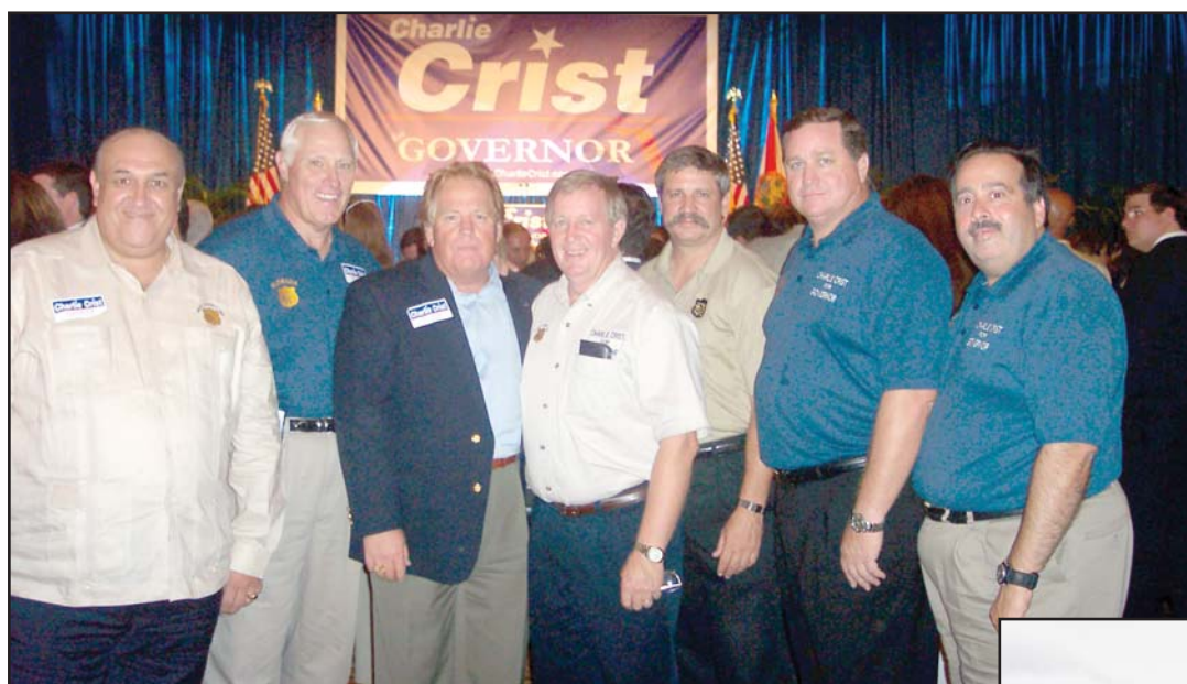
PBA officials joined Charlie Crist at his Primary Victory Party on Tuesday night, September 5th.