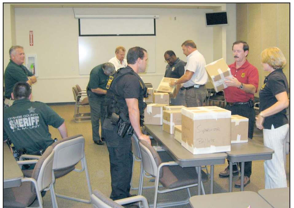
PBA Staff Reps verify that ballot box seals are intact prior to opening them for the OCSO (Deputy/Supervisor) ratification vote count.