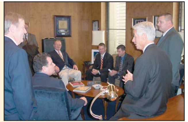
Candidate for Governor Charlie Crist: (Left) Attorney General Charlie Crist with State Correctional Officers Chapter members as they express their support for his campaign. (Center) Attorney General Crist with PBA at the Anti-Murder Rally held on the steps of the Capitol. (Right) Attorney General Crist meets with PBA and State Law Enforcement Officers to discuss law enforcement issues.