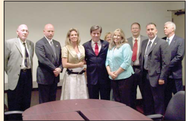
Candidate for Governor Rod Smith: (Left) Senator Rod Smith meets with PBA in preparation of the legislative session. (Center) Senator Smith pledges support for correctional officer issues at the SCO Chapter Rally in Tally. (Right) Senator Smith with PBA and Florida Highway Patrol Troopers during the legislative session to discuss legislative goals.