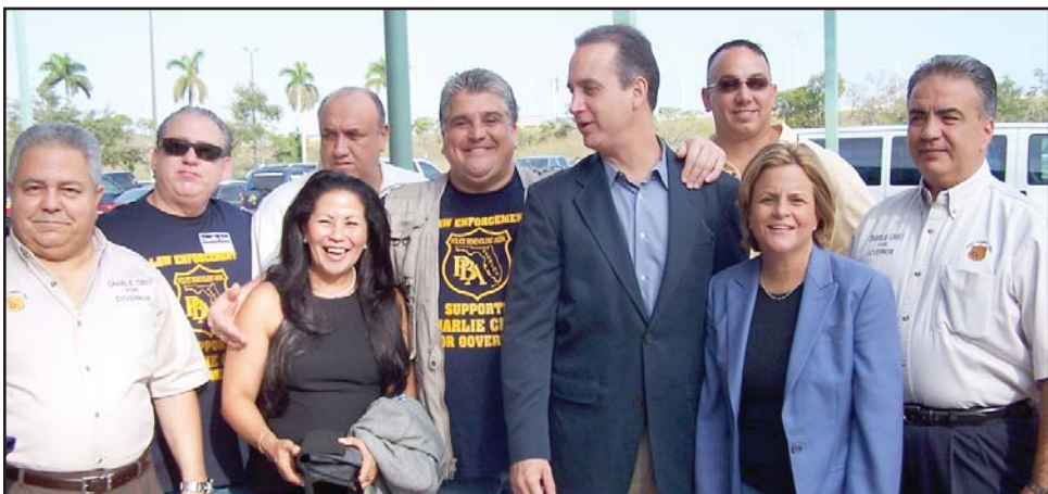
Dade County PBA at a Charlie Crist political rally. Second from right, Congresswoman Ileana Ros-Lehtinen. Fourth from right: Congressman Mario Diaz-Balart.