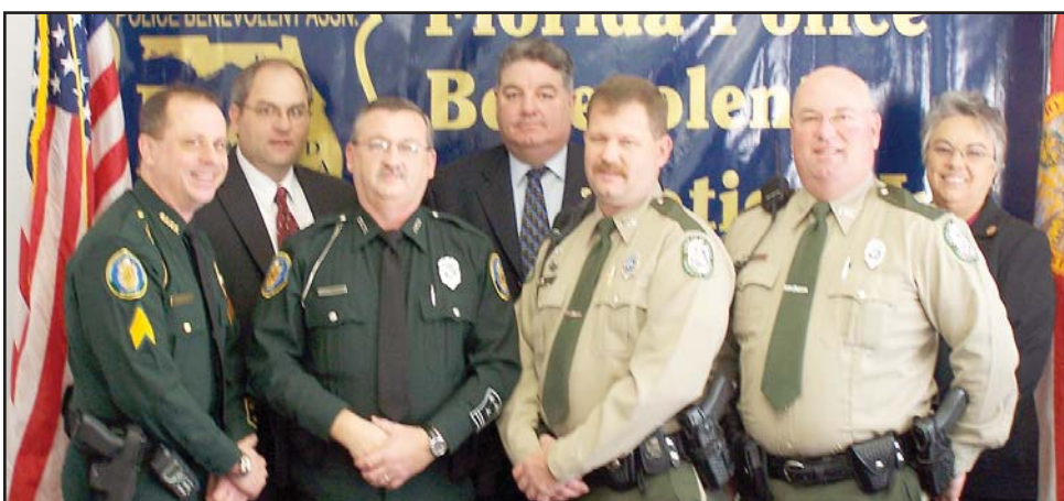
The newly elected board members of the State Law Enforcement Officers Chapter meet for a strategy session at PBA in Tallahassee.