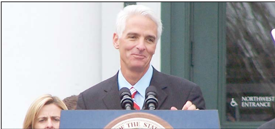
Governor Charlie Crist delivering his inauguration speech at the Capitol on January 2nd, 2007.