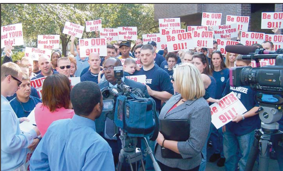
Tallahassee Police Officers and their families turned out en masse for the rally held on November 13, 2007. While the unity among PBA members was impressive, the City of Tallahassee refused to improve its offer, so impasse was declared.