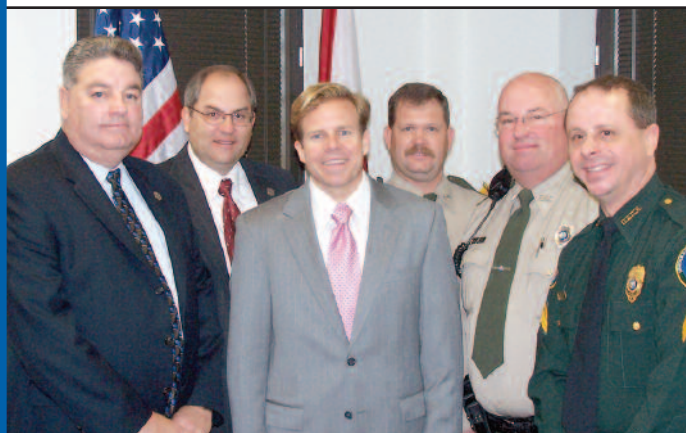
Senator Mike Haridopolos