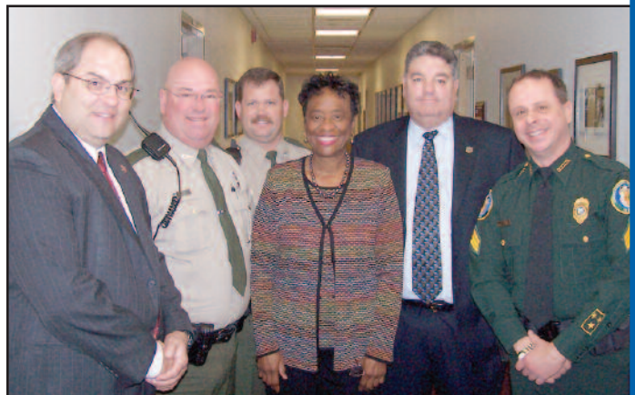
Senator Arthenia Joyner