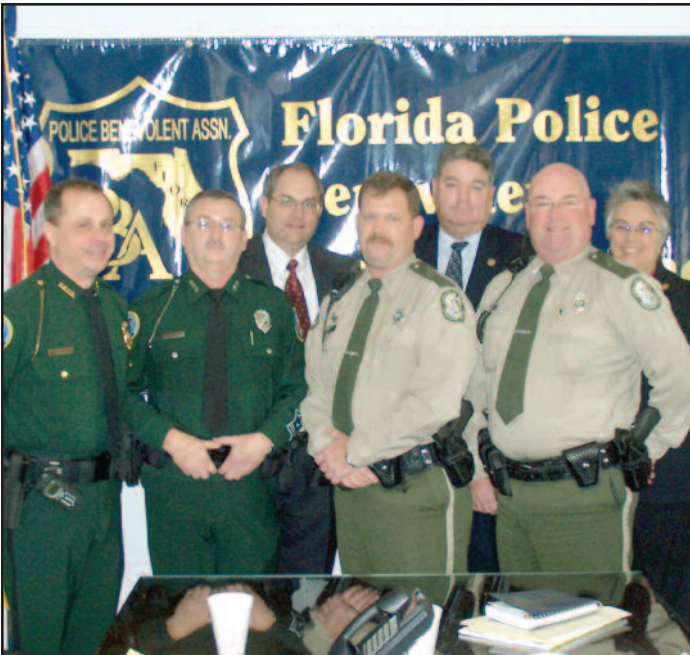
Your Newly Elected SLEO Chapter Executive Board Members and Directors Meeting at PBA.