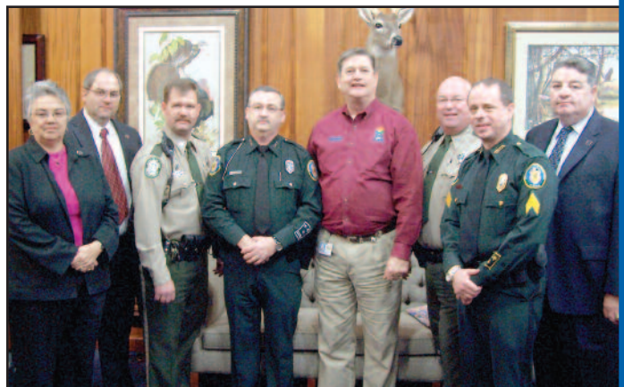
Commissioner of Agriculture Charles Bronson