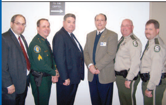
Senator Victor Crist